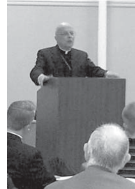
Liturgical Institute founder, Cardinal Francis George, OMI opens the conference.

supported the tenets of Liturgiam Authenticam as able to provide helpful guidelines for liturgical translations.